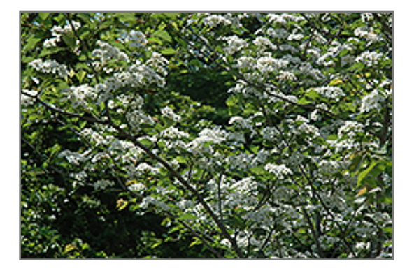
Winter King Hawthorn flowers

This tree should only be grown in full sunlight. It is very adaptable to both dry and moist growing conditions, but will not tolerate any standing water. It may require supplemental watering during periods of drought or extended heat. It is not particular as to soil type or pH. It is highly tolerant of urban pollution and will even thrive in inner city environments. This is a selection of a native North American species.