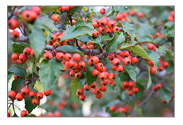
Winter King Hawthorn fruit

Moana Lane Garden Center & Corporate Office South Virginia St. Garden Center 1100 W. Moana Lane Reno, NV 89509 (775) 825-0600 (775) 825-0602 - Corporate Office