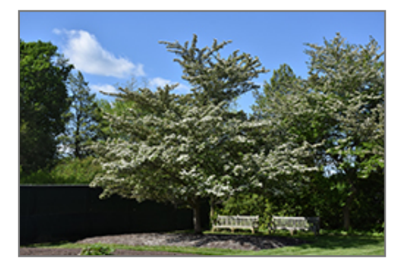
Winter King Hawthorn in bloom

Winter King Hawthorn is recommended for the following landscape applications;