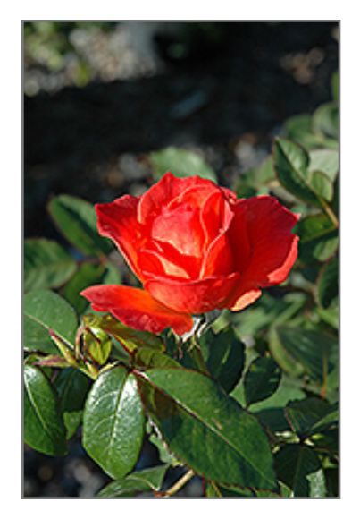
Livin' Easy Rose flowers

Moana Lane Garden Center & Corporate Office South Virginia St. Garden Center 1100 W. Moana Lane Reno, NV 89509 (775) 825-0600 (775) 825-0602 - Corporate Office