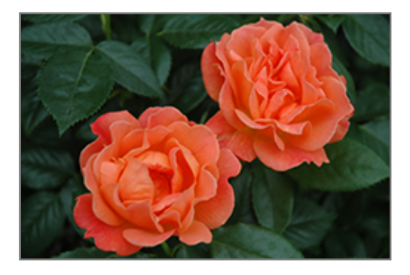
Livin' Easy Rose flowers