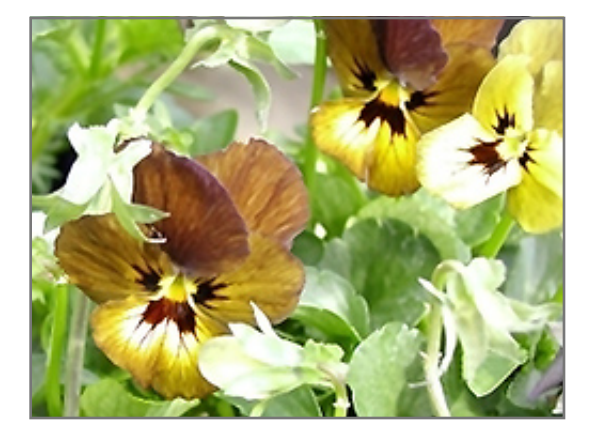
Irish Molly Pansy flowers