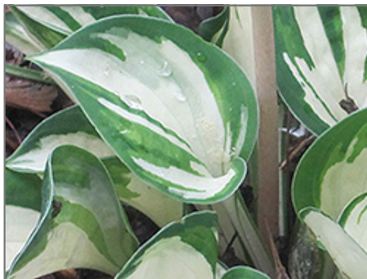
Pandora's Box Hosta foliage

Pandora's Box Hosta is recommended for the following landscape applications;