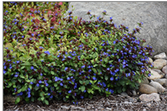
Plumbago in bloom