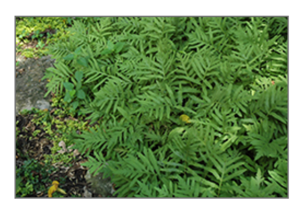
Sensitive Fern