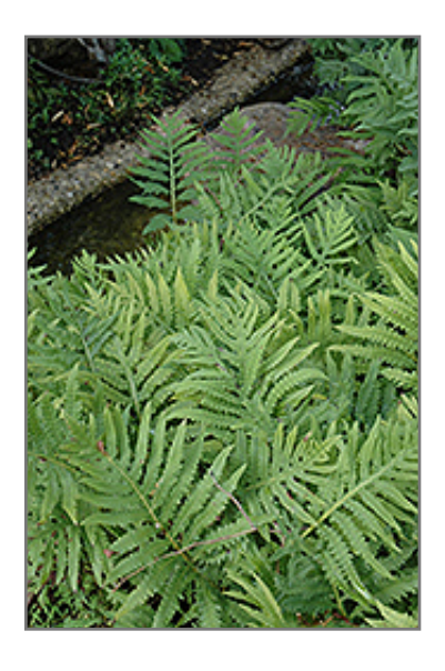
Sensitive Fern foliage