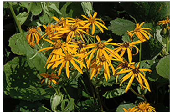
Othello Rayflower flowers