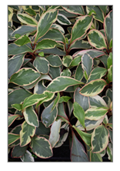
Ginny Peperomia foliage