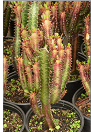
Rubra African Milk Tree in full