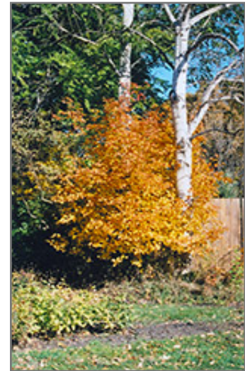
Saskatoon Juneberry in fall