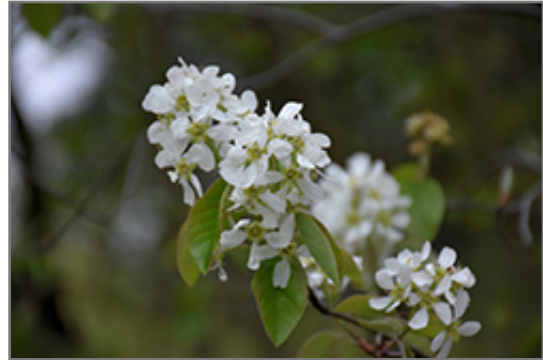
Saskatoon Juneberry flowers

Saskatoon Juneberry is a multi-stemmed deciduous shrub with an upright spreading habit of growth. Its relatively fine texture sets it apart from other landscape plants with less refined foliage.