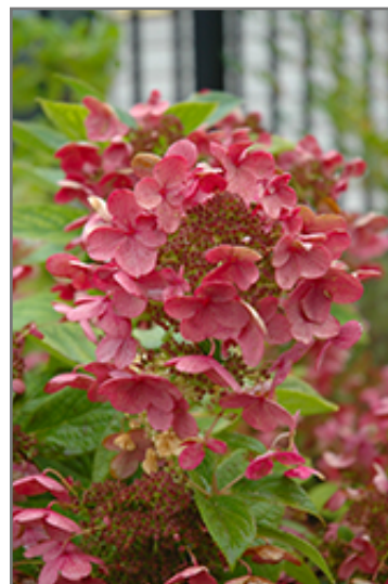
Quick Fire Hydrangea flowers (faded)

This shrub performs well in both full sun and full shade. It prefers to grow in average to moist conditions, and shouldn't be allowed to dry out. It may require supplemental watering during periods of drought or extended heat. It is not particular as to soil type or pH. It is highly tolerant of urban pollution and will even thrive in inner city environments. Consider applying a thick mulch around the root zone in winter to protect it in exposed locations or colder microclimates. This is a selected variety of a species not originally from North America.