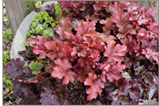
Peach Flambe Coral Bells

Peach Flambe Coral Bells is a fine choice for the garden, but it is also a good selection for planting in outdoor pots and containers. It is often used as a 'filler' in the 'spiller-thriller-filler' container combination, providing a mass of flowers and foliage against which the larger thriller plants stand out. Note that when growing plants in outdoor containers and baskets, they may require more frequent waterings than they would in the yard or garden.