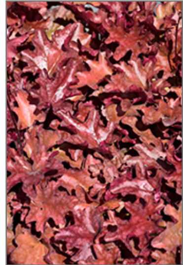
Peach Flambe Coral Bells foliage

This is a relatively low maintenance plant, and should be cut back in late fall in preparation for winter. It is a good choice for attracting hummingbirds to your yard. It has no significant negative characteristics.