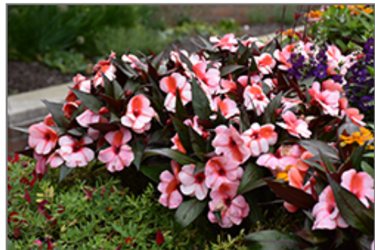
Clockwork Orange Stripe New Guinea Impatiens in bloom