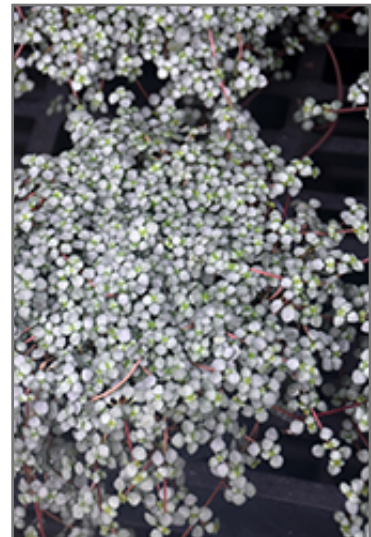
Aquamarine Pilea foliage