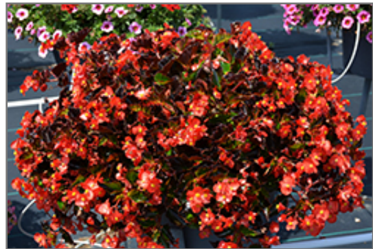
Hula Red Begonia in bloom