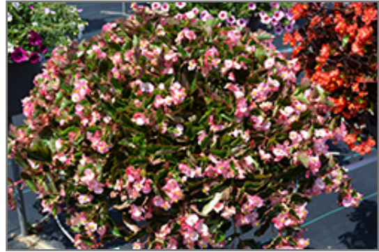
Hula Pink Begonia in bloom