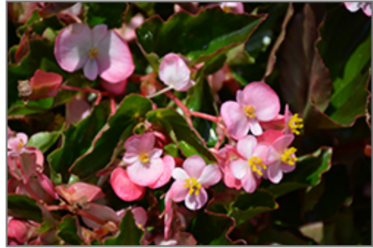
Hula Pink Begonia flowers

Hula Pink Begonia is an herbaceous annual with a ground-hugging habit of growth. Its medium texture blends into the garden, but can always be balanced by a couple of finer or coarser plants for an effective composition.