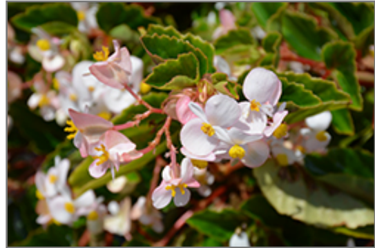
Hula Blush Begonia flowers

This is a high maintenance plant that will require regular care and upkeep, and usually looks its best without pruning, although it will tolerate pruning. Deer don't particularly care for this plant and will usually leave it alone in favor of tastier treats. Gardeners should be aware of the following characteristic(s) that may warrant special consideration;