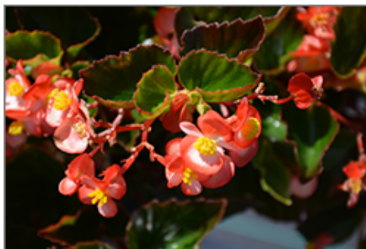
Hula Bicolor Red White Begonia flowers