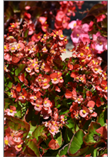
Hula Bicolor Red White Begonia flowers

Hula Bicolor Red White Begonia is an herbaceous annual with a ground-hugging habit of growth. Its medium texture blends into the garden, but can always be balanced by a couple of finer or coarser plants for an effective composition.