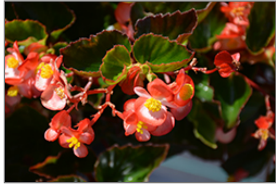
Hula Bicolor Red White Begonia flowers

Hula Bicolor Red White Begonia is a fine choice for the garden, but it is also a good selection for planting in outdoor containers and hanging baskets. Because of its spreading habit of growth, it is ideally suited for use as a 'spiller' in the 'spiller-thriller-filler' container combination; plant it near the edges where it can spill gracefully over the pot. Note that when growing plants in outdoor containers and baskets, they may require more frequent waterings than they would in the yard or garden.