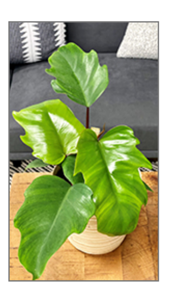
Prismacolor Mayoi Fern-like Philodendron in full

When grown indoors, Prismacolor Mayoi Fern-like Philodendron can be expected to grow to be about 8 feet tall at maturity, with a spread of 3 feet. It grows at a fast rate, and under ideal conditions can be expected to live for approximately 10 years. This houseplant performs well in both bright or indirect sunlight and strong artificial light, and can therefore be situated in almost any well-lit room or location. It does best in average to evenly moist soil, but will not tolerate standing water. The surface of the soil shouldn't be allowed to dry out completely, and so you should expect to water this plant once and possibly even twice each week. Be aware that your particular watering schedule may vary depending on its location in the room, the pot size, plant size and other conditions; if in doubt, ask one of our experts in the store for advice. It will benefit from a regular feeding with a general-purpose fertilizer with every second or third watering. It is not particular as to soil type or pH; an average potting soil should work just fine. Be warned that parts of this plant are known to be toxic to humans and animals, so special care should be exercised if growing it around children and pets.