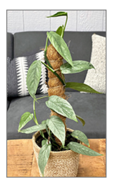
Beautifall Cebu Blue Pothos in full

When grown indoors, Beautifall Cebu Blue Pothos can be expected to grow to be about 9 feet tall at maturity, with a spread of 24 inches. It grows at a fast rate, and under ideal conditions can be expected to live for approximately 10 years. This houseplant will do well in a location that gets either direct or indirect sunlight, although it will usually require a more brightly-lit environment than what artificial indoor lighting alone can provide. It does best in average to evenly moist soil, but will not tolerate standing water. The surface of the soil shouldn't be allowed to dry out completely, and so you should expect to water this plant once and possibly even twice each week. Be aware that your particular watering schedule may vary depending on its location in the room, the pot size, plant size and other conditions; if in doubt, ask one of our experts in the store for advice. It will benefit from a regular feeding with a general-purpose fertilizer with every second or third watering. It is not particular as to soil type or pH; an average potting soil should work just fine. Be warned that parts of this plant are known to be toxic to humans and animals, so special care should be exercised if growing it around children and pets.