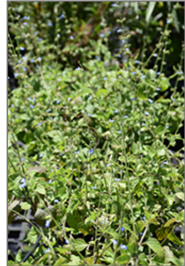
Southern River Sage flowers