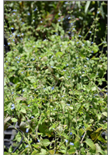
Southern River Sage flowers