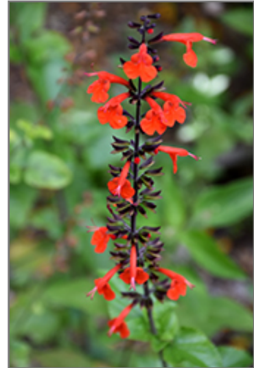
Scarlet Sage flowers

Scarlet Sage is recommended for the following landscape applications;