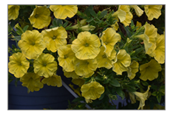
Capella Hello Yellow Petunia flowers

Capella Hello Yellow Petunia is recommended for the following landscape applications;