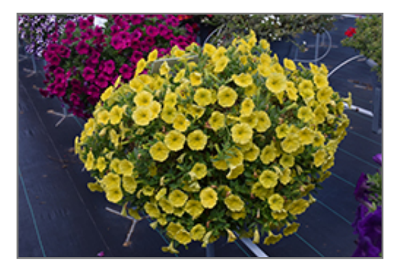
Capella Hello Yellow Petunia in bloom

Moana Lane Garden Center & Corporate Office South Virginia St. Garden Center 1100 W. Moana Lane Reno, NV 89509 (775) 825-0600 (775) 825-0602 - Corporate Office