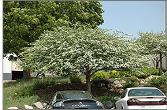
Thornless Cockspur Hawthorn in bloom