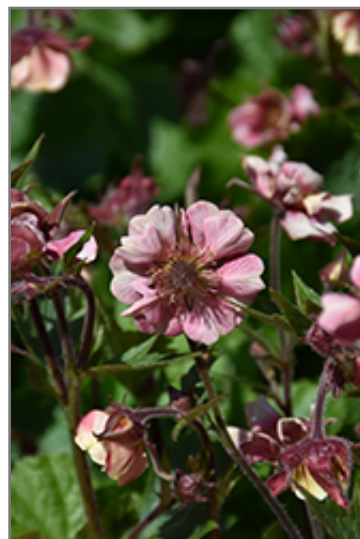
Tempo Rose Avens flowers

Tempo Rose Avens is recommended for the following landscape applications;