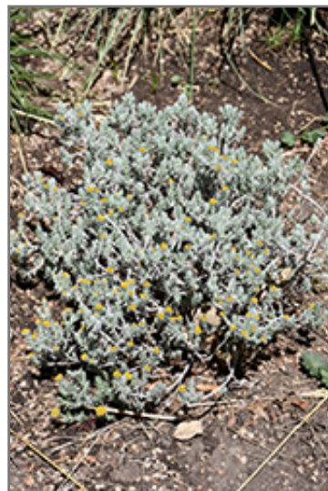
SteppeSuns Hokubetsi