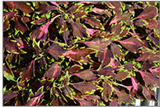
PartyTime Red Bolero Coleus foliage

PartyTime Red Bolero Coleus is recommended for the following landscape applications;