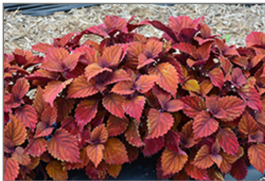
Inferno Coleus