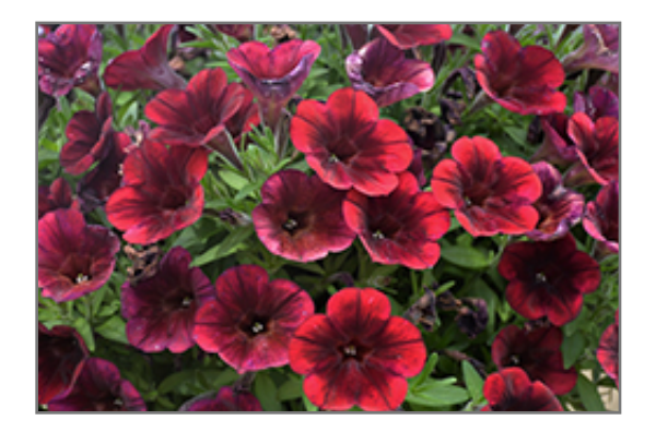
Sweetunia Velveteen Petunia flowers

Sweetunia Velveteen Petunia is a dense herbaceous annual with a mounded form. Its medium texture blends into the garden, but can always be balanced by a couple of finer or coarser plants for an effective composition.