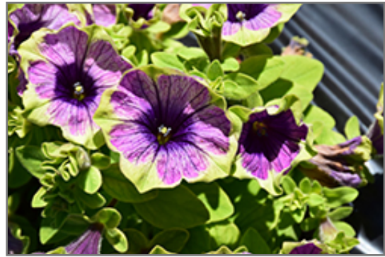
Surprise Green Tambourine Petunia flowers

This plant will require occasional maintenance and upkeep. Trim off the flower heads after they fade and die to encourage more blooms late into the season. It is a good choice for attracting butterflies and hummingbirds to your yard, but is not particularly attractive to deer who tend to leave it alone in favor of tastier treats. It has no significant negative characteristics.