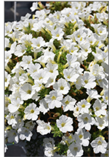
Itsy White Petunia flowers

This plant will require occasional maintenance and upkeep. Trim off the flower heads after they fade and die to encourage more blooms late into the season. It is a good choice for attracting bees, butterflies and hummingbirds to your yard, but is not particularly attractive to deer who tend to leave it alone in favor of tastier treats. It has no significant negative characteristics.