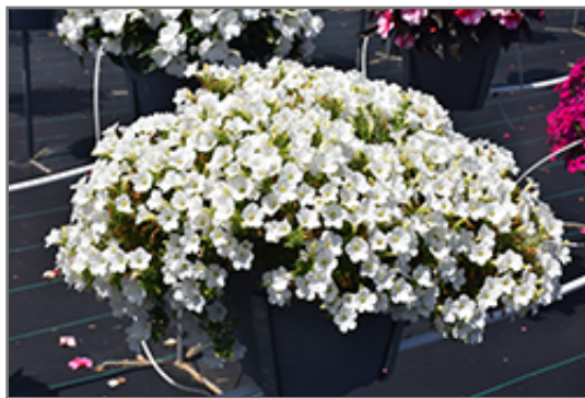
Itsy White Petunia in bloom