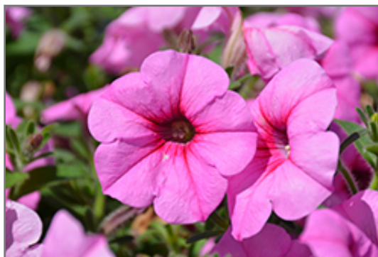
Durabloom Royal Pink Petunia flowers

Durabloom Royal Pink Petunia is recommended for the following landscape applications;