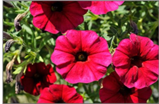
SuperCal Royal Red Petchoa flowers

SuperCal Royal Red Petchoa will grow to be about 12 inches tall at maturity, with a spread of 18 inches. When grown in masses or used as a bedding plant, individual plants should be spaced approximately 15 inches apart. Its foliage tends to remain dense right to the ground, not requiring facer plants in front. This fast-growing annual will normally live for one full growing season, needing replacement the following year.