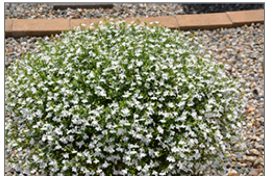
Suntory Trailing White Lobelia in bloom