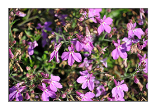
Hot+ Electric Purple Lobelia flowers

A wonderful heat tolerant and uniform series, showing excellent performance in garden beds and containers: heavy basal branching and long season flowering; larger, brighter and more vibrant blooms are presented over small green foliage