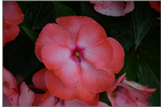
Painted Select Peach New Guinea Impatiens flowers

Painted Select Peach New Guinea Impatiens is recommended for the following landscape applications;