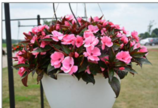
Painted Select Light Pink New Guinea Impatiens in bloom