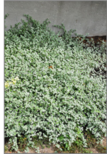
Silver Licorice Plant

Silver Licorice Plant is a fine choice for the garden, but it is also a good selection for planting in outdoor containers and hanging baskets. Because of its trailing habit of growth, it is ideally suited for use as a 'spiller' in the 'spiller-thriller-filler' container combination; plant it near the edges where it can spill gracefully over the pot. Note that when growing plants in outdoor containers and baskets, they may require more frequent waterings than they would in the yard or garden.