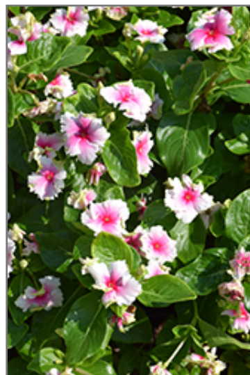
Soiree Flamenco Seniorita Pink Vinca in bloom

This plant will require occasional maintenance and upkeep, and should not require much pruning, except when necessary, such as to remove dieback. It is a good choice for attracting butterflies to your yard, but is not particularly attractive to deer who tend to leave it alone in favor of tastier treats. It has no significant negative characteristics.