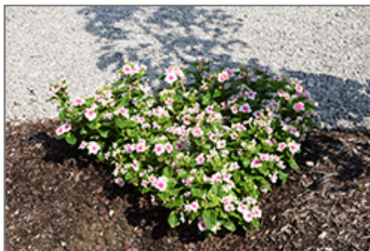
Soiree Flamenco Seniorita Pink Vinca in bloom

Soiree Flamenco Seniorita Pink Vinca is a fine choice for the garden, but it is also a good selection for planting in outdoor containers and hanging baskets. It is often used as a 'filler' in the 'spiller-thriller-filler' container combination, providing a mass of flowers against which the thriller plants stand out. Note that when growing plants in outdoor containers and baskets, they may require more frequent waterings than they would in the yard or garden.