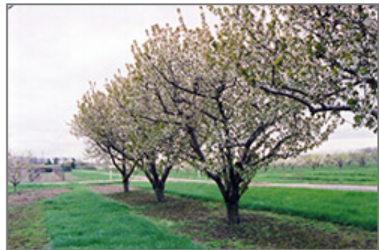
Sweet Cherry in bloom