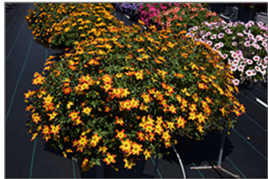
Blazing Glory Bidens in bloom