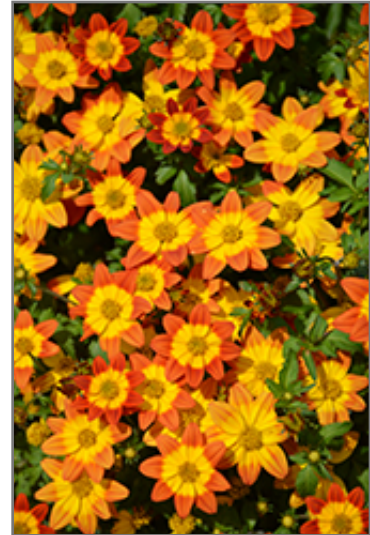
Blazing Glory Bidens flowers

Blazing Glory Bidens is recommended for the following landscape applications;