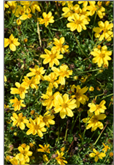
Bidy Gonzales Big Bidens flowers

Bidy Gonzales Big Bidens is recommended for the following landscape applications;