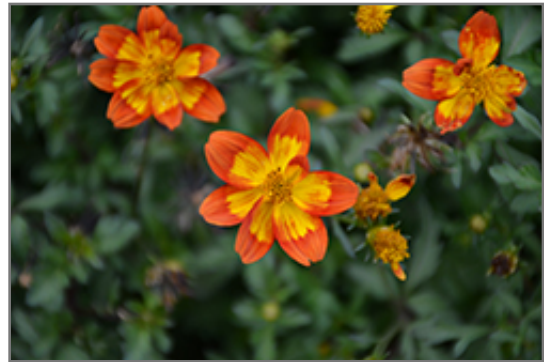
Bidy Boom Wildfire Bidens flowers

Bidy Boom Wildfire Bidens is recommended for the following landscape applications;