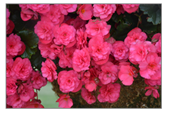
Vermillion Hot Pink Begonia flowers

Height: 12 inches Spread: 12 inches Spacing: 10 inches Sunlight: Hardiness Zone: (annual) Group/Class: Rieger Begonia Description: