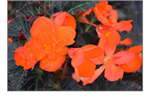
l'Conia Portofino Orange Begonia flowers