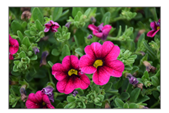
Cabrio Burgundy Calibrachoa flowers