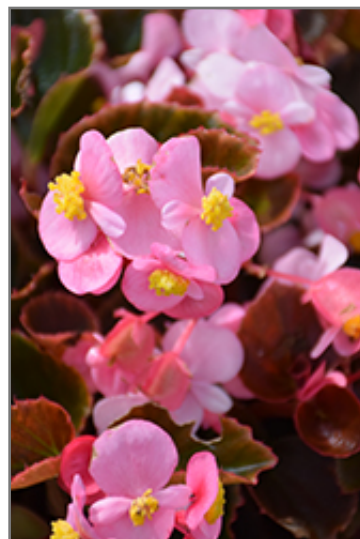
Cocktail Brandy Begonia flowers

This plant will require occasional maintenance and upkeep. Trim off the flower heads after they fade and die to encourage more blooms late into the season. Deer don't particularly care for this plant and will usually leave it alone in favor of tastier treats. Gardeners should be aware of the following characteristic(s) that may warrant special consideration;