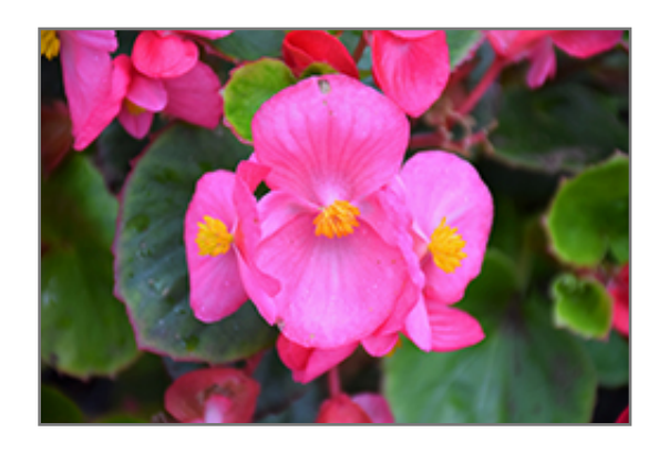
Bada Bing Rose Begonia flowers

Bada Bing Rose Begonia is an herbaceous annual with a mounded form. Its medium texture blends into the garden, but can always be balanced by a couple of finer or coarser plants for an effective composition.