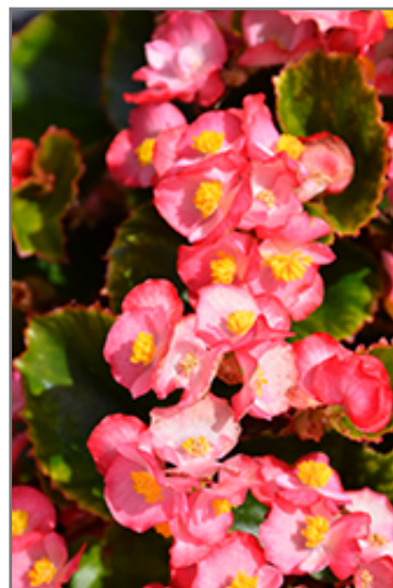
Ambassador Rose Blush Begonia flowers