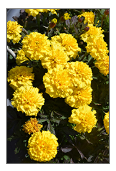
Happy Yellow Marigold flowers